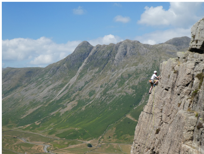
Serendipity (S) - Kettle Crag, Langdale