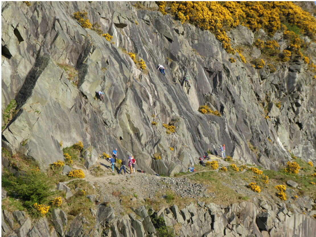
Bramcrag Quarry – the best crag in the Lakes: probably.