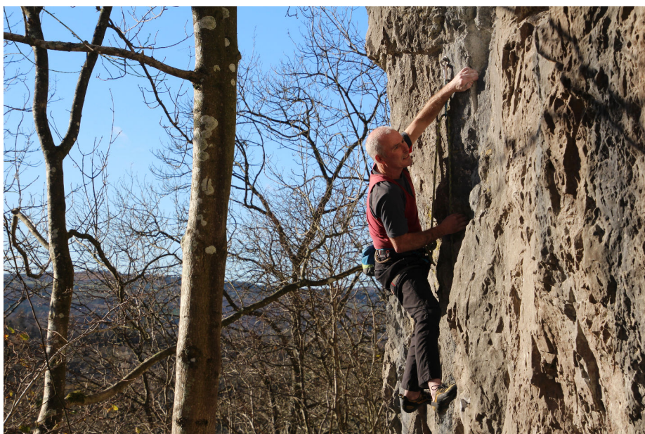
Chapel Head Scar Bleep and Booster