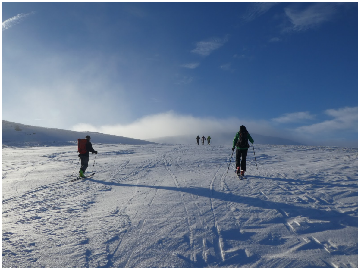
Dowthwaite to Greenside ski traverse - ascent of Great Dodd - December 2016

Be safe and enjoy the climbing this winter.