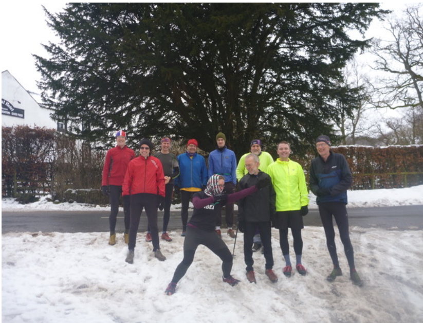
Start of EVMC Fell Race at Dockray