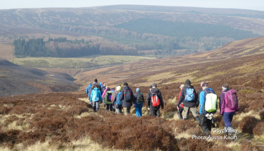
Goyt Valley.