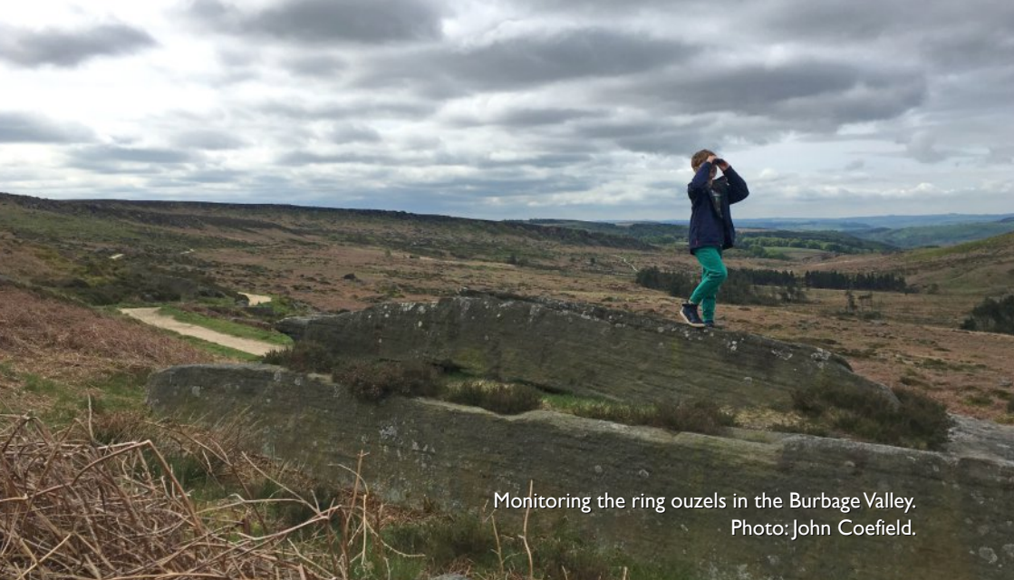
Monitoring the ring ouzels in the Burbage Valley.