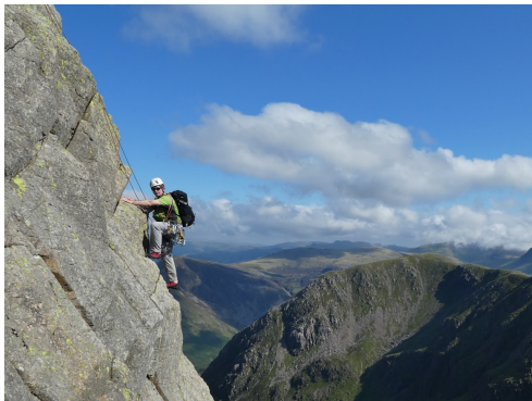
Oxford and Cambridge Climb - Grey Crag - Buttermere