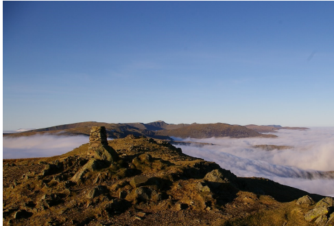
Helvellyn Ridge from Red Screes

The next meeting of the BMC Lakes area will be a Zoom Meeting on Wednesday 27 th May 2020 at 7.30 pm.