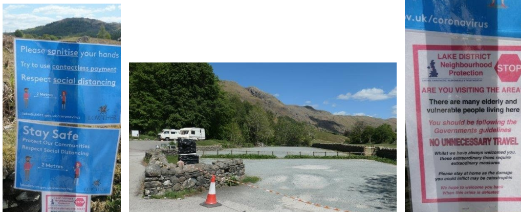
Some recent images from Great Langdale !!

The BMC will continue to provide the best advice they can as the crisis develops and ask the outdoor community to be respectful of others as we navigate our way back to some form of normality.