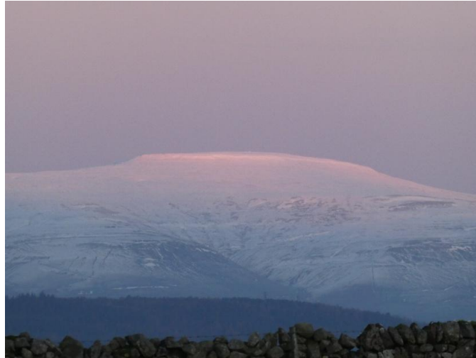
Cross Fell in the evening glow

There is so much that can be said about where we are - but let's move on to the future!