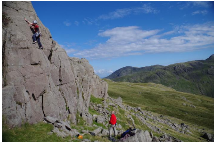
Dream Buttress - Gaitkins - Duddon Valley