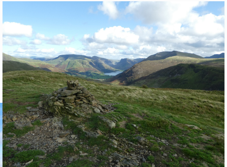
Buttermere from Hencomb

For Grey Crag and Tarn Crag, there is a local Fell runner Bus Service to Burnbanks, next to Haweswater, which runs on a Thursday. This was followed by walking up by Naddle Valley onto Selside, then Branstree followed by Tarn Crag and Grey Crag with good timing to set up camp, next to a stream, on the way down with a fine view over Morecambe Bay. The next day was down into Longsleddale and up along the opposite ridge with Shipman's Knott, Kentmere Pike etc. to eventually drop down to Hartsop. 10 summits in the bag!