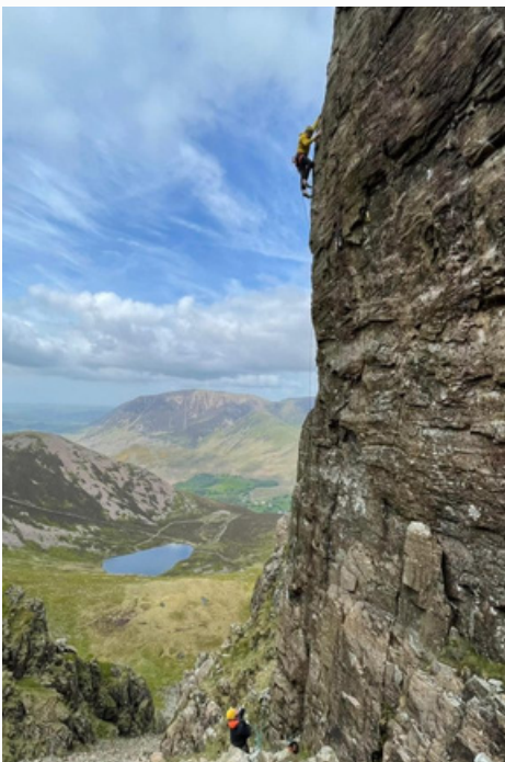
Boogie Wonderland (E4), Chapel Crag