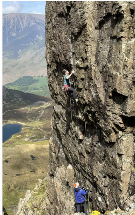
Born To Be Alive (E6), Chapel Crag