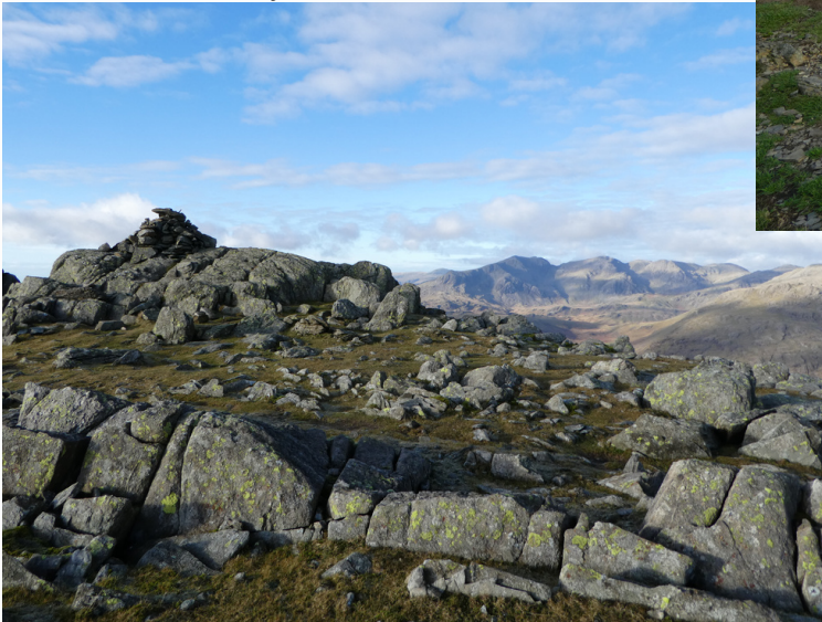
Scafells from Grey Friar

Two areas with Grey Crag and Tarn Crag above Longsleddale (the Far Far Eastern Fells area) and Grike, Crag Fell and Lank Rigg (the Far Western Fells) caused some pondering and the tent came into action on the following routes.